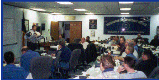
Management College public speaking forum.

Limited computer facilities are accessible to students; however, out-of-area participants may want to bring their own equipment to assist in the completion of assignments.