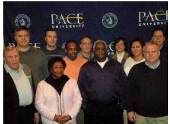
Group photograph of the Ethics Train-the-Trainer class conducted January 13-15, 2009, at Pace University in White Plains, New York.