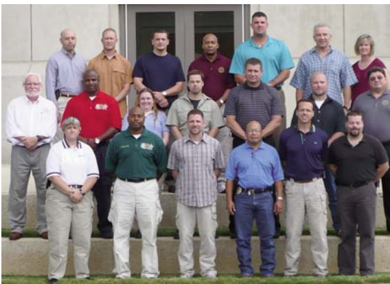
Ethics Train-the-Trainer class conducted September 16-18, 2009, at Institute headquarters.

Then we see that The Commission on Public Integrity (CPI), the State of New York’s watchdog panel decided just recently that “no one would be given a failing grade on the [online ethics] test.” i The story there goes that this decision to fail no one was made “after a bug in the system was found to be handing out failing grades to anyone who got less than a perfect score.” ii The plot sickens when we read that state employees are not required to take the test, nor is there any real incentive to do so. No one was penalized for failing it and the CPI revised the online exam to give you the right answer if you gave the wrong one, whereas the older version with the “bugs” only told you if you had the answer right or wrong. Again, whether this is a deliberate “dumbing-down” of what appears to be an important examination, I cannot say.