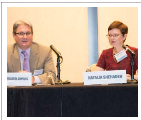
2013 Oilfield Services Conference