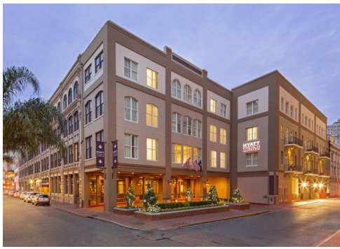
Hyatt French Quarter New Orleans

The conference is co-sponsored by the American Bar Association Young Lawyers Division and Houston Young Lawyers Association and supported by BP, Chevron, ConocoPhillips and ExxonMobil.