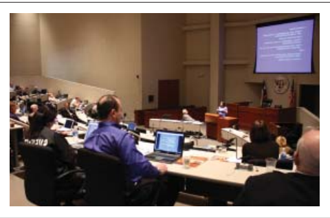
Past Contemporary Issues and Ethics Conferences

As 2014 came to a close, police organizations in the U.S. found themselves under intense scrutiny once again. The police actions in Ferguson, Missouri and Staten Island, New York (and several other instances), revealed the perception or the reality that justice is meted out in an unfair or biased manner.