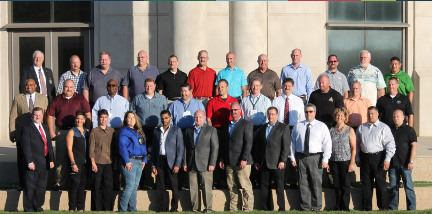
Ethics Train-the-Trainer Graduates

Institute for LAW ENFORCEMENT ADMINISTRATION