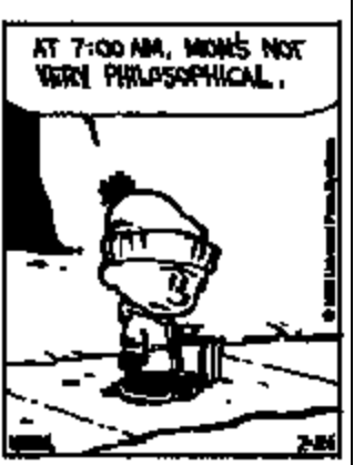
CALVIN AND HOBBES @1991 Watterson. Reprinted with permission of UNIVERSAL PRESS SYNDICATE. All rights reserved.