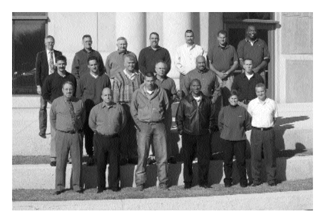
Group photograph of the Ethics Train-the-Trainer class conducted December 8-12, 2003, in Plano, Texas.