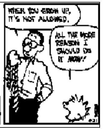
CALVIN AND HOBBES @ 1990 Watterson. Reprinted with permission of UNIVERSAL PRESS SYNDICATE. All rights reserved.