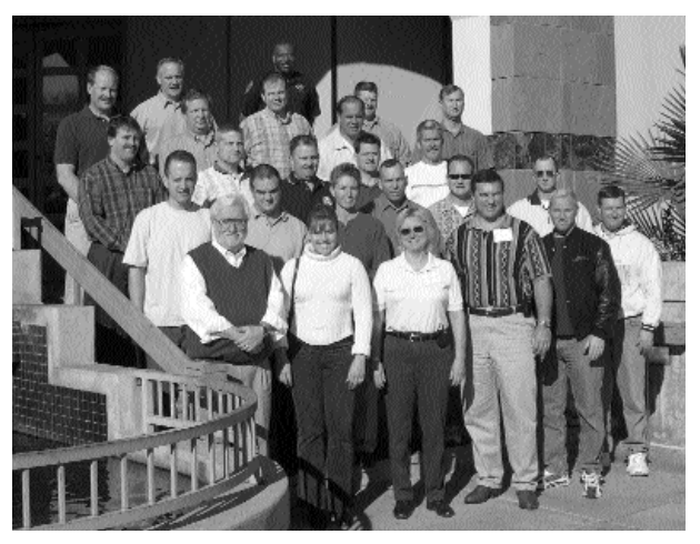
Group photograph of the Ethics Train-the-Trainer class conducted January 12-16, 2004, in San Bernardino, California.

Among the agenda items scheduled for discussion or action are an update on the Collaborative Leadership Project in the Lexington-Fayette (KY) Urban County Division of Police; an annual police ethics survey; the law enforcement ethics poster project; and dis-