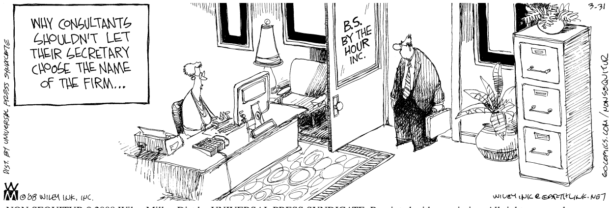
NON SEQUITUR © 2008 Wiley Miller. Dist by UNIVERSAL PRESS SYNDICATE. Reprinted with permission. All rights reserved.