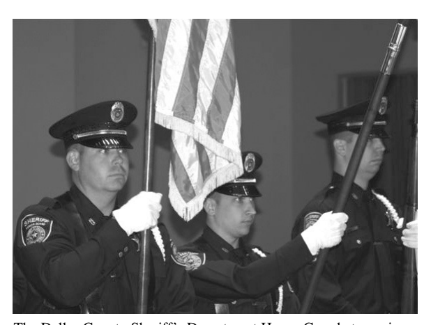
The Dallas County Sheriff's Department Honor Guard at opening ceremonies of the Contemporary Issues and Ethics Conference.