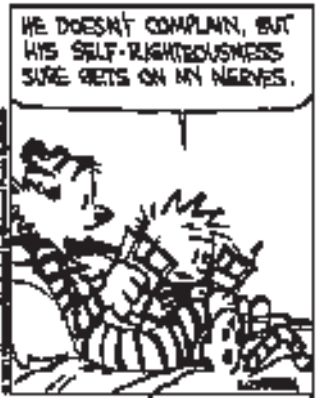
CALVIN AND HOBBES @1991 Watterson. Dist. By UNIVERSAL PRESS SYNDICATE. Reprinted with permission. All rights reserved.