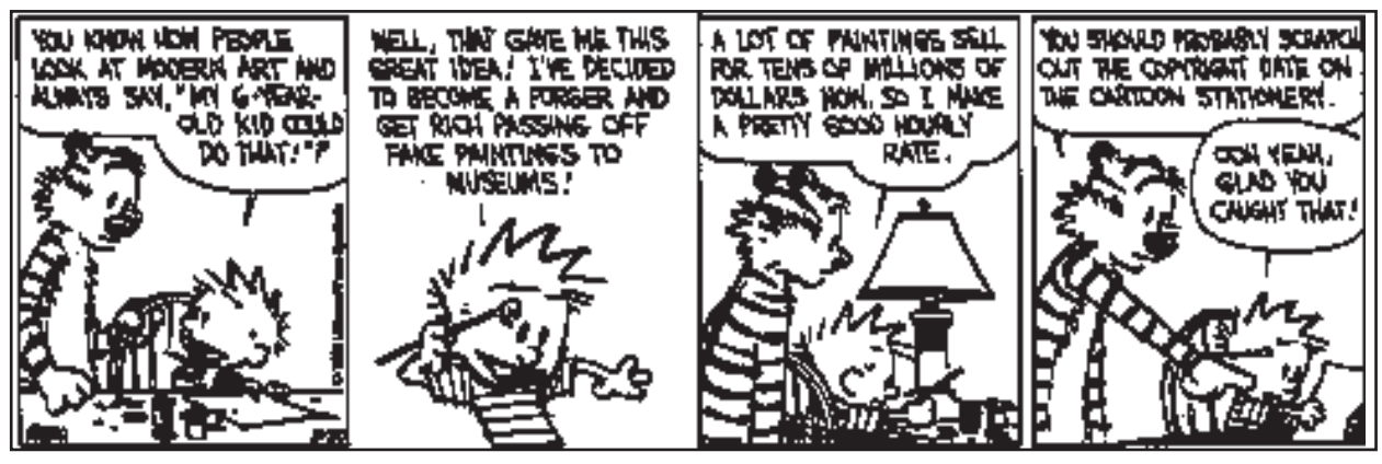
CALVIN AND HOBBES @ 1990 Watterson. Dist. By UNIVERSAL PRESS SYNDICATE. Reprinted with permission. All rights reserved.