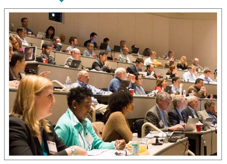
51st Annual Conference on Intellectual Property Law