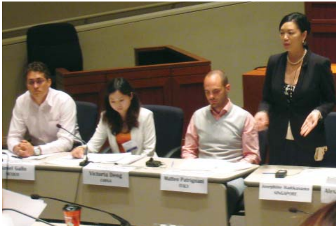
Participants tackle a practical international compliance problem.