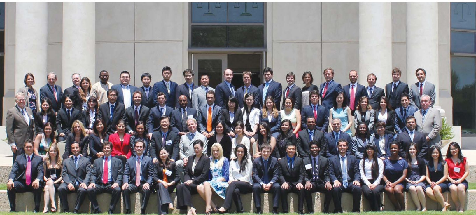
The Class of 2013