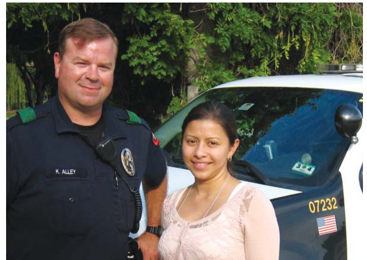
Participants have the chance to go on patrol with local police.