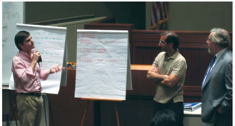
Interactive classes highlight national and cultural points of view.