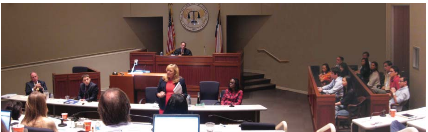
Academy participants take part in a mock civil trial, serving as plaintiff, defendant, jurors, and witnesses.