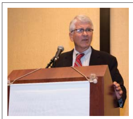
2014 Energy Litigation Conference