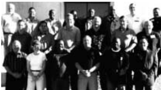
Group photo of the Ethics Train-the-Trainer class conducted April 7-11, 2003, at the Institute for Law Enforcement Administration in Plano, Texas.