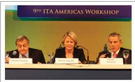
2013 Americas Workshop in São Paulo

“The content, faculty and overall Workshop quality was excellent.”