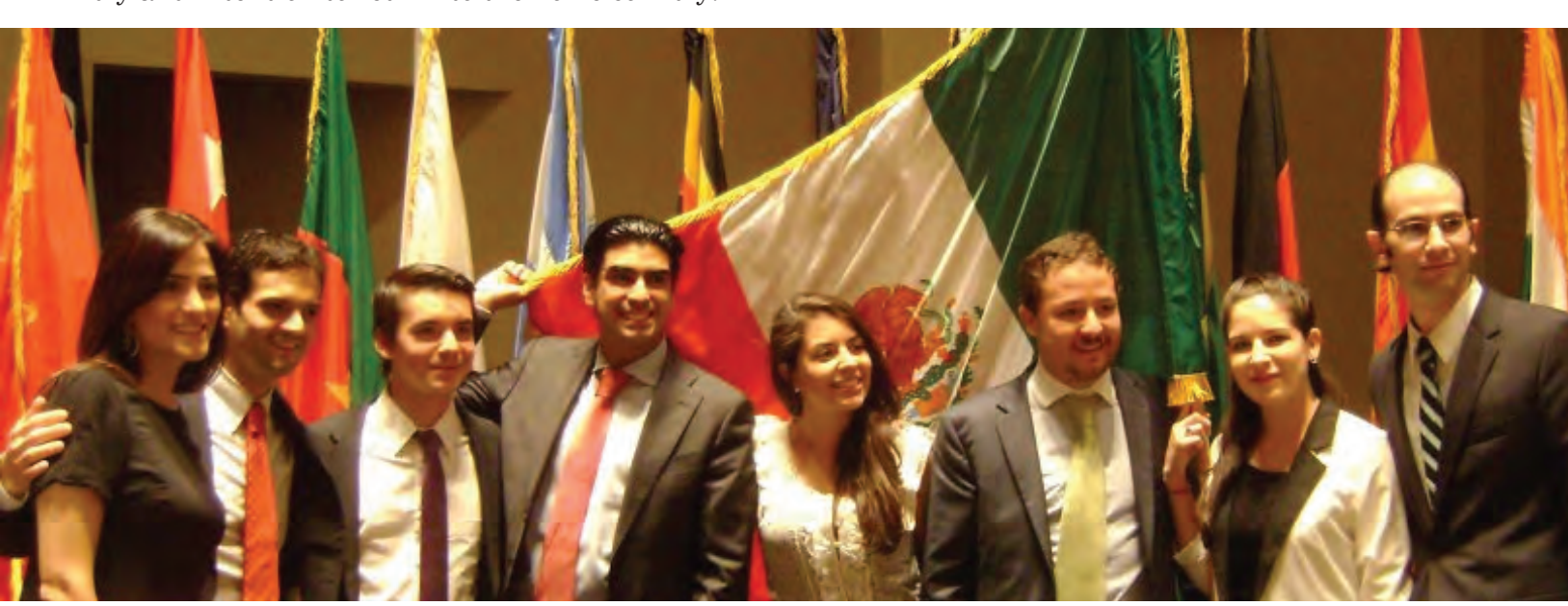
↑ After farewell ceremonies, Mexican participants pose in front of the Mexican flag.

Because the Academy is in the nature of an extended continuing legal education conference for foreign attorneys that have previously completed their degree studies, we do not issue a Certificate of Eligibility. You will, however, have a copy of your letter of admission to the Academy.