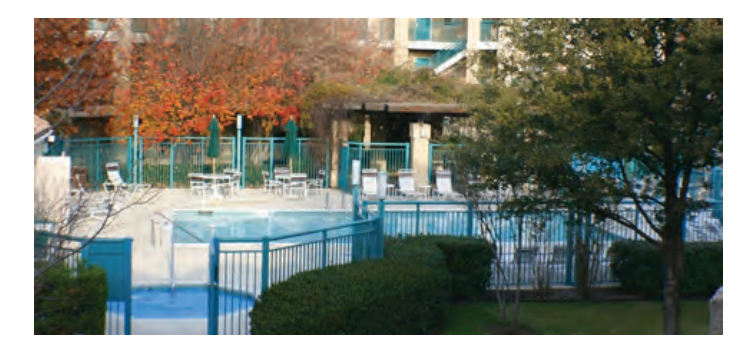
Luggage - Please put your name and Hyatt House' address on all of your luggage. If luggage is misplaced during your flight, it will then be delivered to the hotel instead of being sent back to your home country.

What to wear - The average high temperature in the Dallas area during the months of June and July is in the high 90s Fahrenheit (34 Celsius and up). You may wear appropriate informal, comfortable clothes (for example, pants or slacks and a shirt or blouse) to the classes. However, the classroom is air-conditioned, and you may wish to have a sweater or jacket with you. Business attire is customary dress for a few activities, such as law firm receptions and the farewell luncheon. You may wish to wear national attire for the class photograph. Bring shorts and tee shirts for lounging around the hotel and pool. And bring your swimsuit.