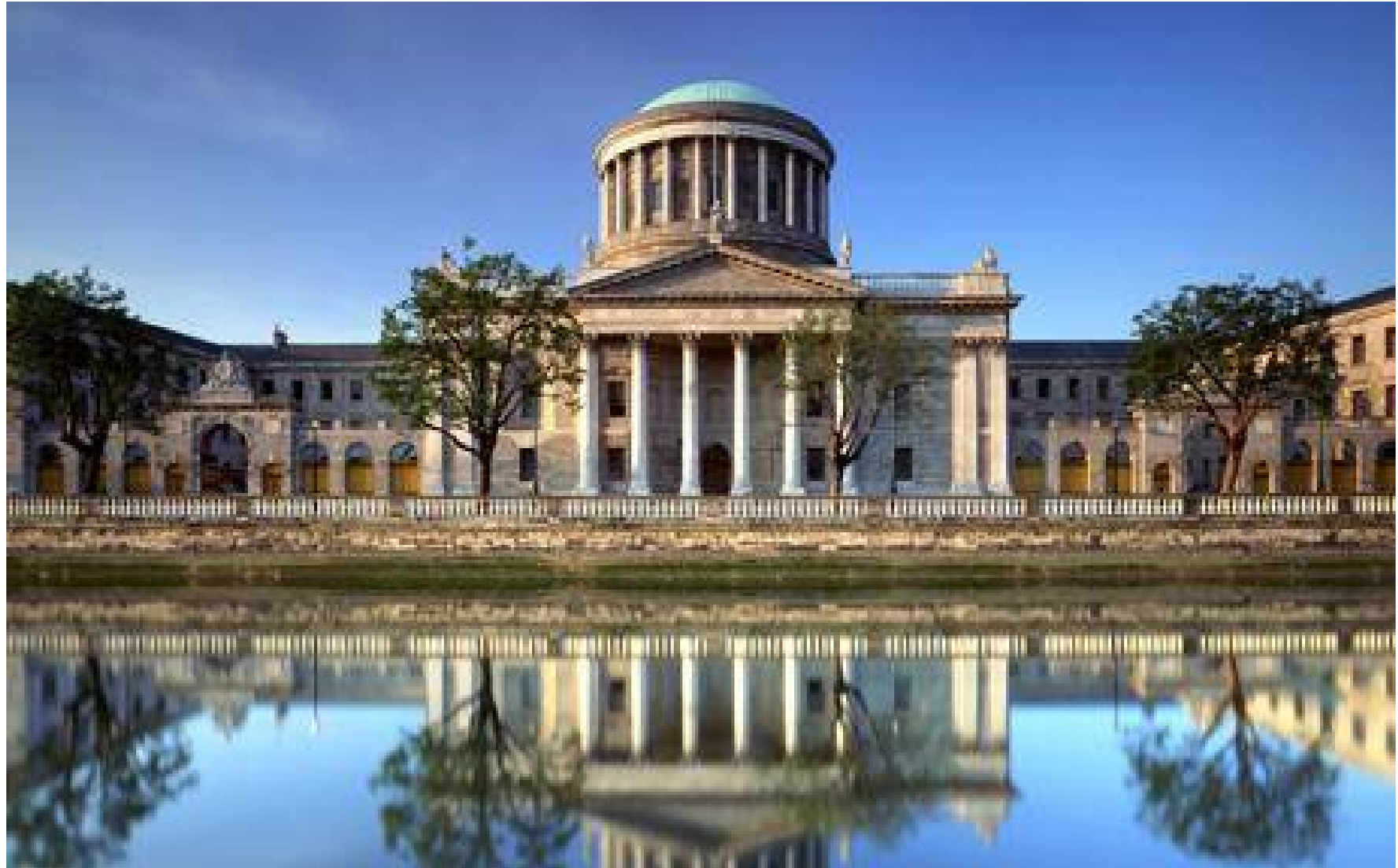
The Four Courts, Dublin