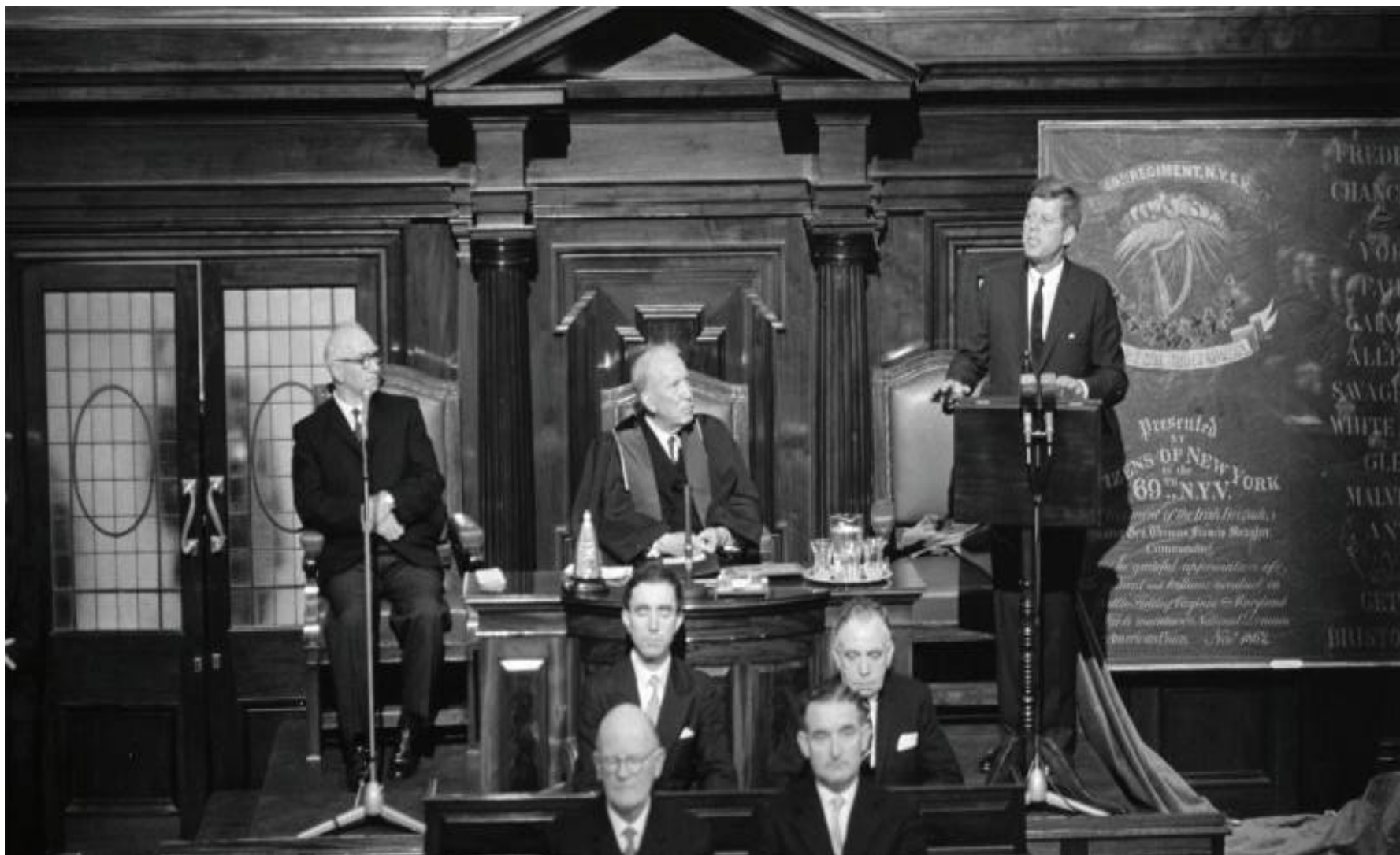
President Kennedy addressing a Joint Sitting of the Houses of the Oireachtas, Leinster House, 26 June 1963