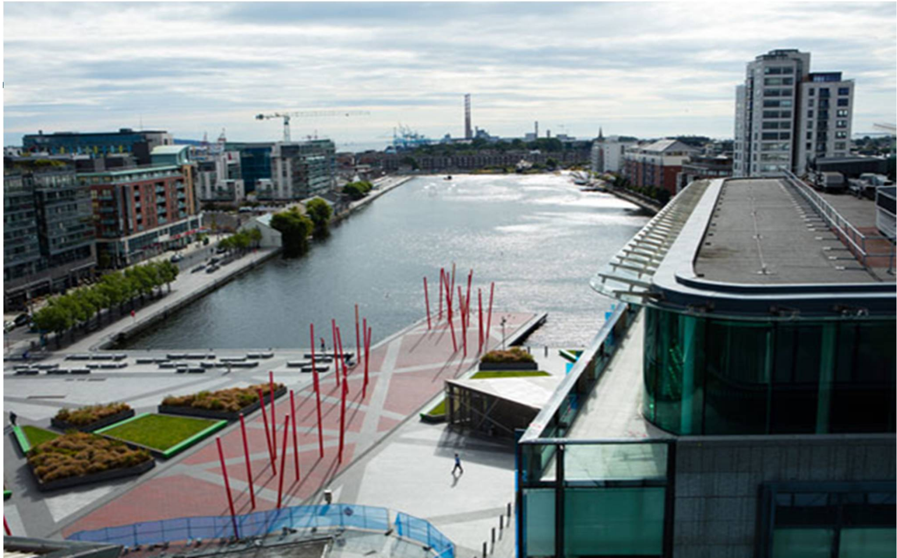
The terrace view of Grand Canal Square, William Fry Head Office