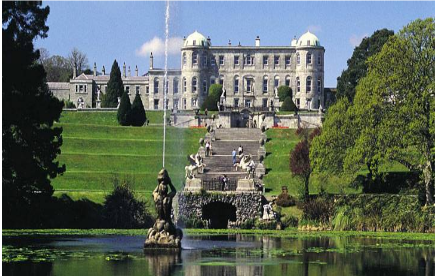
Powerscourt House Estate, Co.Wicklow