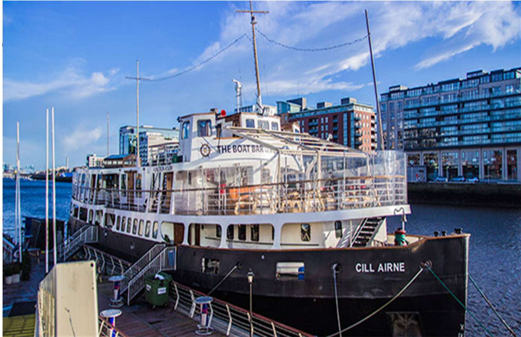
Quay 16 Restaurant, The Boat, Cill Áirne