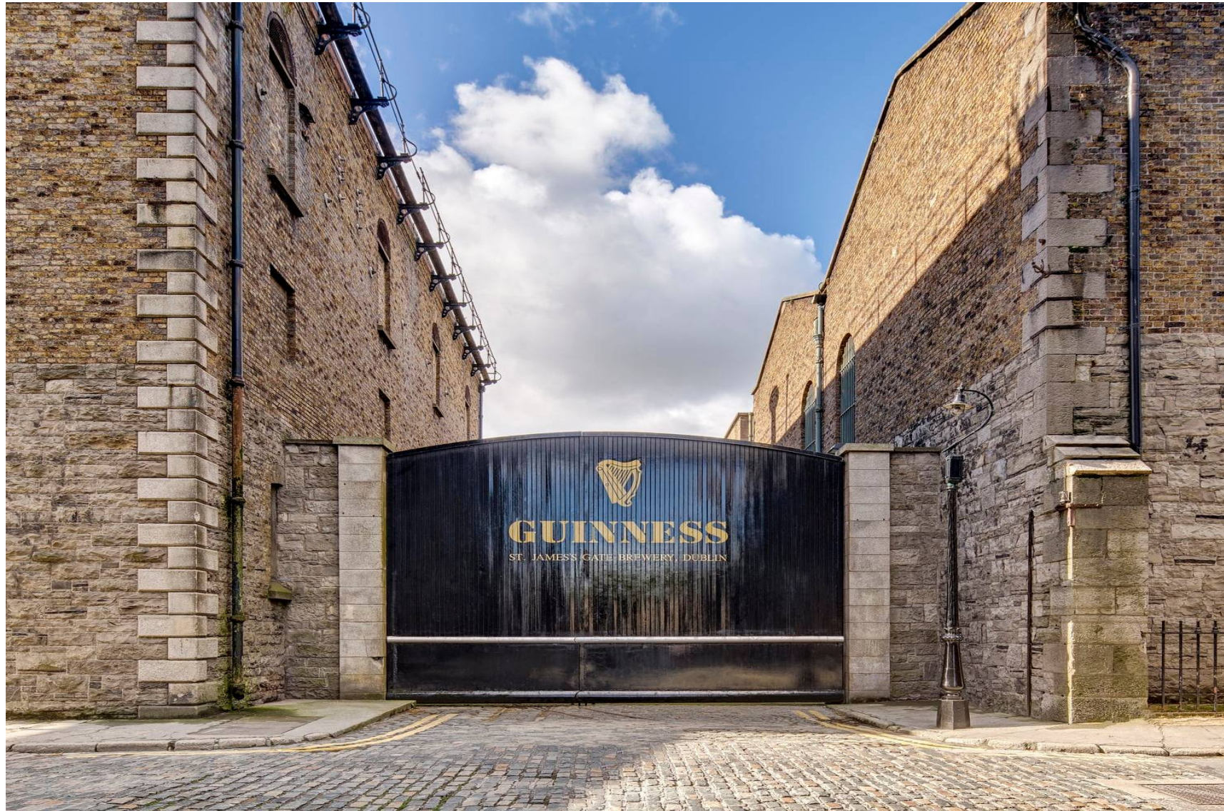
Guinness, St. James's Gate Brewery