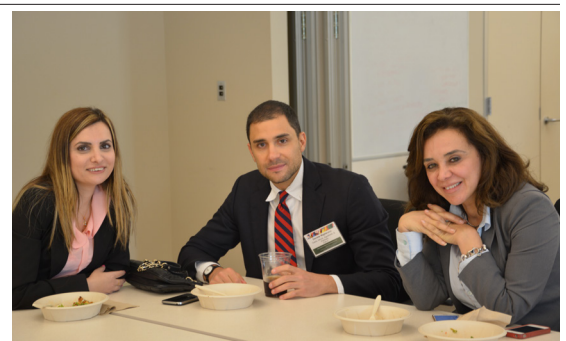
Participants from the 53rd Annual Academy of American and International Law