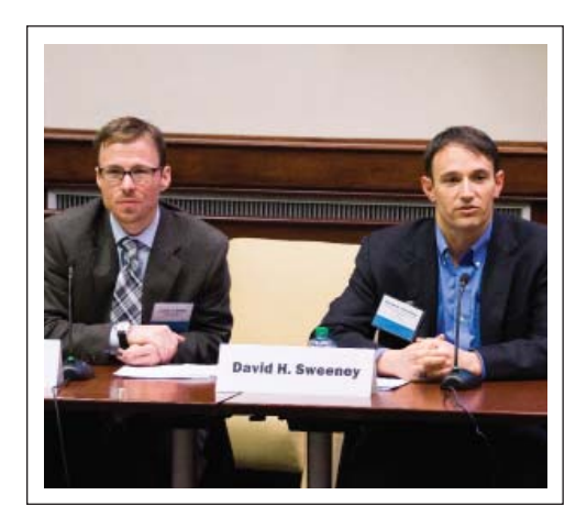
2014 Career Paths for Young Energy Attorneys