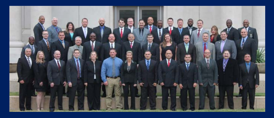
Above: The 117<sup>th</sup> School of Police Supervision graduated 41 officers on Oct. 30, 2015 from Texas and Oklahoma. Below: The 118<sup>th</sup> School of Police Supervision graduated 36 officers on Jan. 29, 2016. Congratulations to the 117<sup>th</sup> and 118<sup>th</sup> Schools!

It's easy! You provide the training site, necessary equipment and local marketing support and ILEA provides the faculty, curriculum and national marketing effort. When class enrollment reaches 25 participants, the host agency receives three seats free of charge.