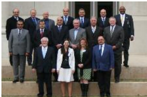
The visiting Generals and Colonels of the Lebanese Internal Security Force and ILEA Staff