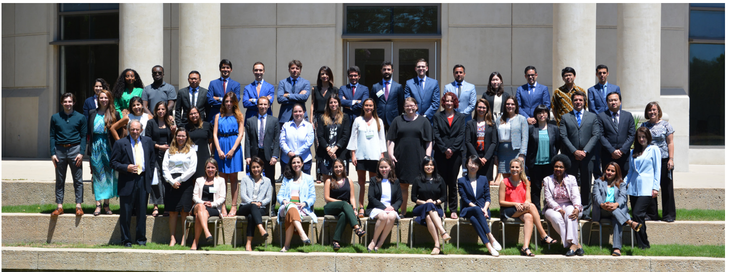
Academy Class of 2018