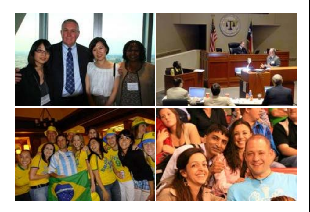
The 2010 Academy enjoyed extracurricular events such as a Texas Rangers baseball game, a Texas rodeo, a tour of an East Texas ranch, and visits to major law firms in the Dallas area. The classes included a mock trial where the participants were 'jurors' and 'witnesses'. And, in case anyone has forgotten, the World Cup was held during this year's Academy (note the picture above, lower left, featuring our Brazilian participants!).